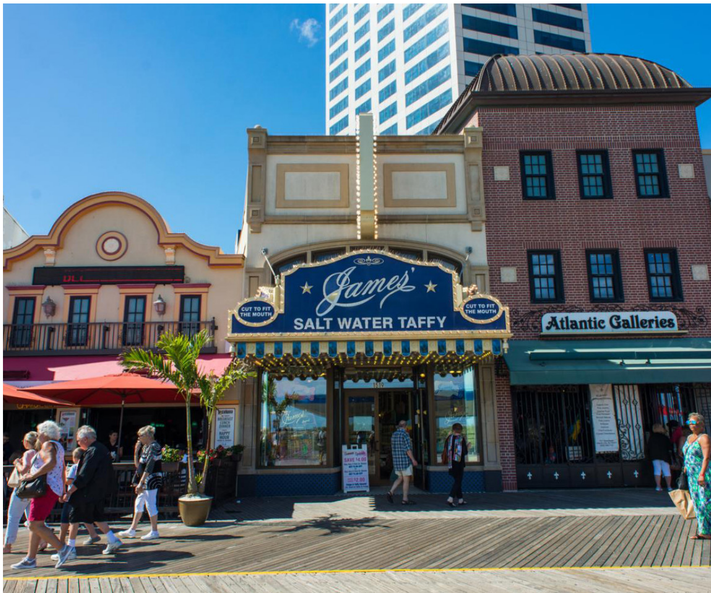
Atlantic City Boardwalk

immediate unmet needs as a result of the pandemic. As described herein, the State's planned rental/utility assistance, education, small business, and public health support programs attempt to address many of the factors exacerbating inequalities. The State will continue to prioritize advancing equity by designing and implementing programs geared toward the long-term equitable distribution of funding. This will ensure that programs and projects consider the groups intended to be served, amplify public awareness of programs, and require data gathering to review program performance toward meeting the goal of serving traditionally marginalized communities.