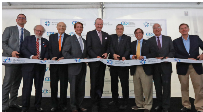
Governor Phil Murphy attends the ribbon cutting ceremony for the Center of Discovery and Innovation at Hackensack Meridian Health.