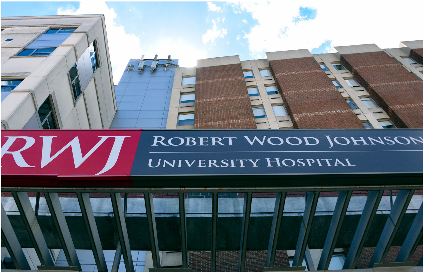
Robert Wood Johnson University Hospital in New Brunswick, New Jersey.

The administration is consistently improving its overarching strategy for evaluating innovative programs and will consider setting aside funds to improve how it uses evidence in program design and review. Thus far, the State has relied on existing research from similar programs around the country and has prioritized expanding existing programs that are "tried and true" and already have a body of evidence in support of their interventions. New Jersey will continue to measure outcomes for these projects and adjust the approach to ensure the effectiveness of the SFRF programming.