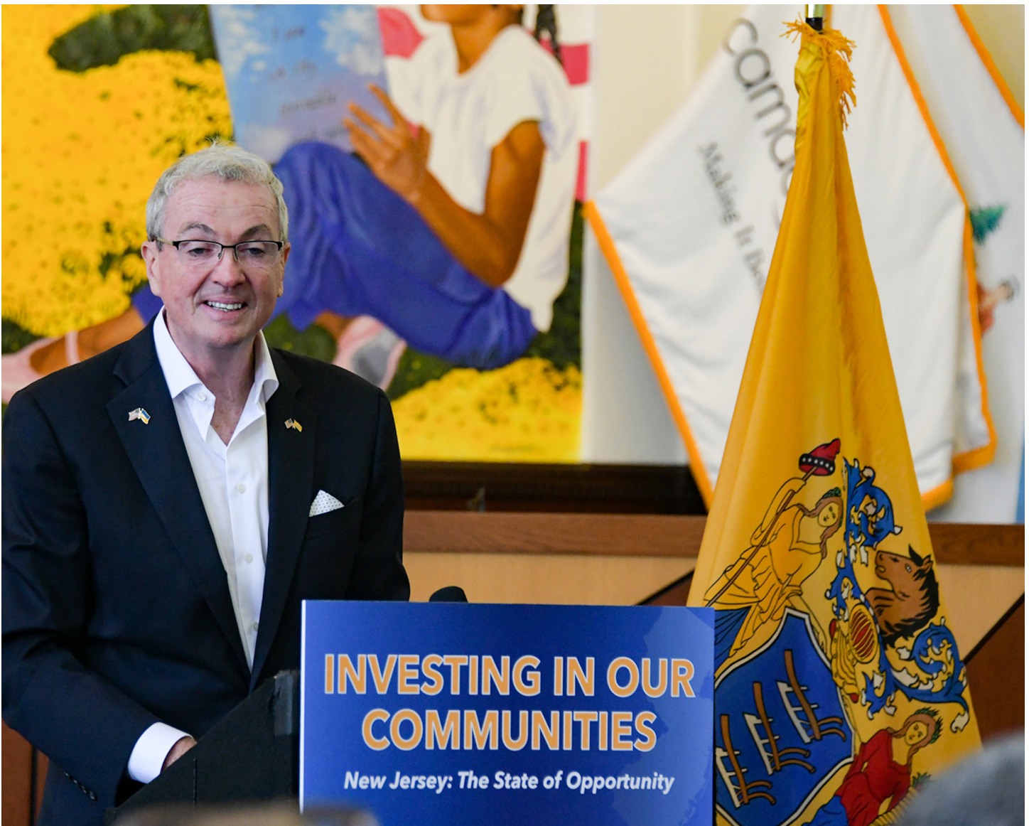
Governor Murphy visits the city of Camden to highlight the direct investments in local communities.