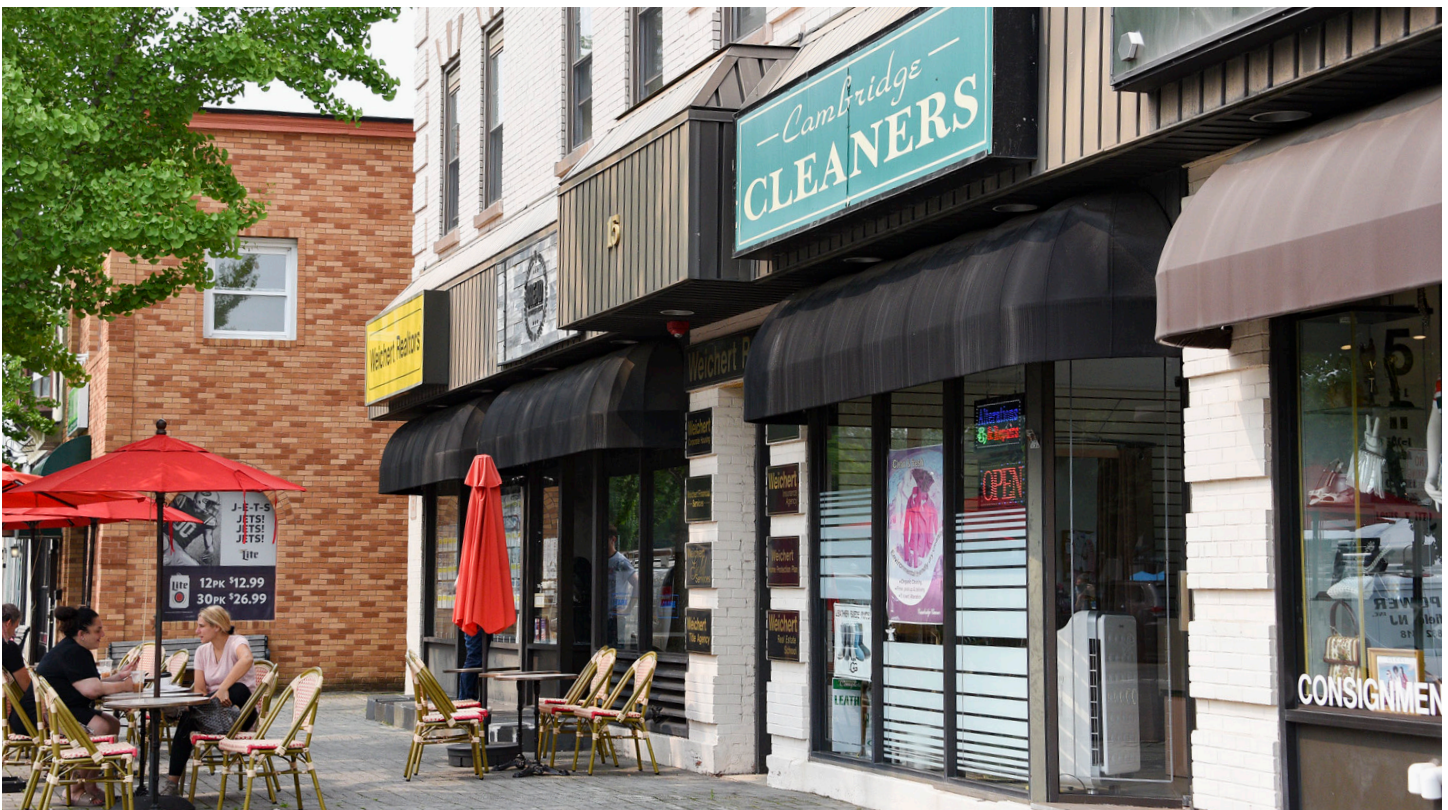
Tenafly, New Jersey

So far, the State has focused primarily on the required performance metrics and is in the process of developing a system for other programs to identify appropriate metrics for the context of their program. Going forward, the State intends to modify the SIROMS grant management system to allow for the collection of more program specific performance metrics. More complete performance metrics will be listed in subsequent reports.