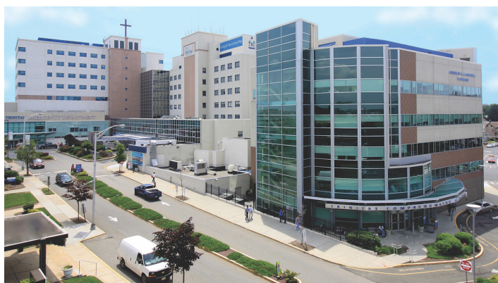
Trinitas Medical Center in Elizabeth, New Jersey

Trinitas Regional Medical Center received $1 million in SFRF funds to construct a 12-bed expansion of the Behavioral Health Department's inpatient Dual Disorder Facility to more than double its current capacity. Dual Disorder patients are those who are faced with an intellectual/developmental disorder and a major psychiatric disorder. This investment is important to the New Jersey health care system because Trinitas is the State's only hospital with inpatient beds for children and adults who have a dual diagnosis. Demand far exceeded supply before the pandemic, but COVID-19 has made the expansion of the facility far more urgent.