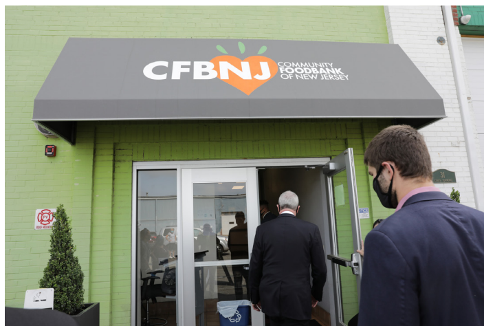
Governor Murphy visits Community FoodBank in Hillside, New Jersey.

NJDA manages the TEFAP food ordering and scheduling of direct shipments from USDA vendors to six State-contracted Emergency Feeding Organizations (EFOs) who have developed a network of over 800 Local Distribution Agencies (LDAs) (food pantries, soup kitchens, homeless shelters, and needy feeding agencies) throughout the State.