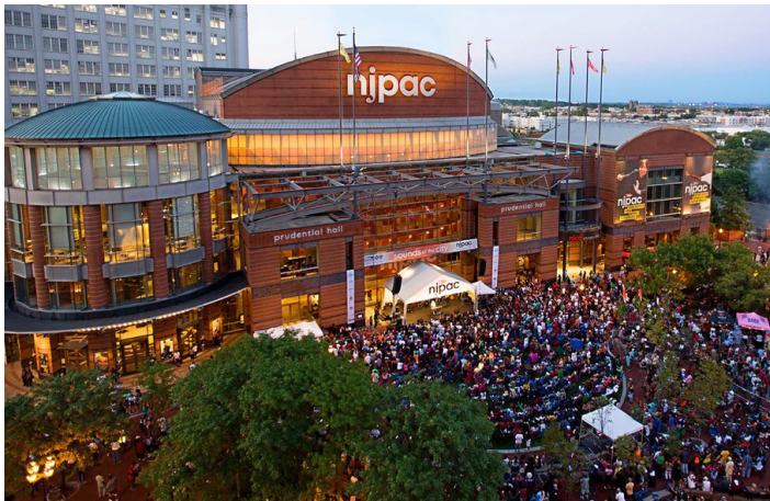
New Jersey Performing Arts Center in Newark, New Jersey

Newark's New Jersey Performing Arts Center (NJPAC) received $5 million to help the organization recoup lost revenue due to COVID-19 event cancellations. As a nonprofit arts organization and an anchor cultural institution, NJPAC is an integral part of New Jersey's leisure and hospitality sector. This sector suffered a 24% decline in revenue and approximately 17% decline in unemployment nationwide because of the public health emergency. SFRF allowed NJPAC to continue operations and retain their employees.