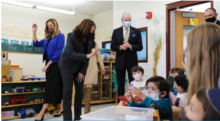
Governor Murphy, Vice President Harris, Rep. Sherrill tour Ben Samuels Children's Center at Montclair State University and hold a roundtable discussion on the importance of investments in childcare.