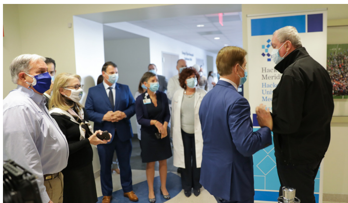
Governor Murphy tours Hackensack Meridian Health and their vaccine clinic.