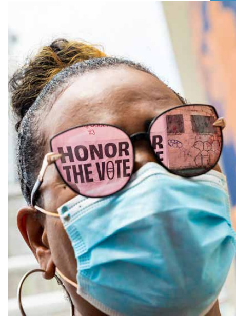
Honor the Vote Exhibit, Atlanta

Too many people in this country — especially people of color — face discriminatory policies and obstacles to exercising their fundamental right to vote. To uphold the federal government's responsibility of ensuring access to the ballot box for all, the administration issued an executive order that directs agencies to help promote voter registration and participation through their existing services, modernizes and improves the website vote.gov , establishes a Native American Voting Rights Steering group, ensures voting access to eligible individuals in federal custody, and ensures access to voting for military and overseas residents.