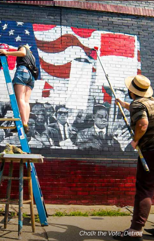
Chalk the Vote, Detroit

The Biden-Harris administration immediately reversed Trump's racist and unlawful executive order excluding undocumented people from the Census count. This Biden-Harris administration executive order clearly defines the purpose of the Census to count all people within our country, an acknowledgment that we cannot have a truly representative democracy and equitable response to environmental injustice if people are left out of the national count.