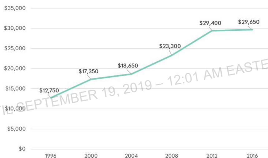
Average Debt of Graduating Seniors who Borrowed (Current Dollars, All 4-Year Colleges)

Several trends in higher education offer helpful context for both the growth in student debt loads as well as the slowdown in borrowing among more recent graduates.