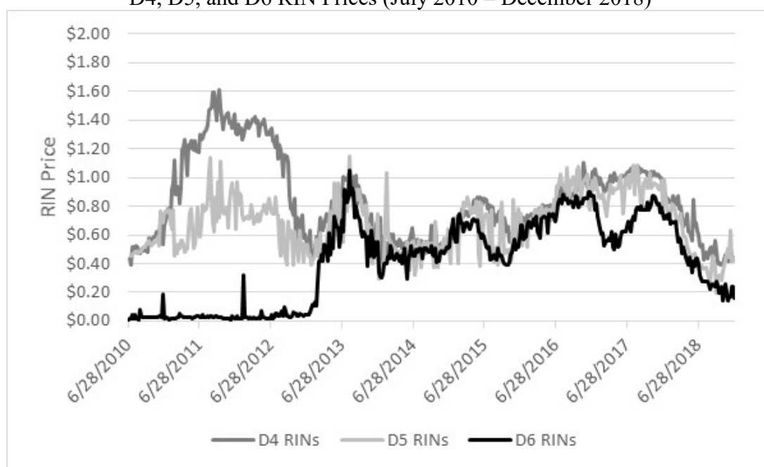
Figure VII.B.2-1 D4, D5, and D6 RIN Prices (July 2010 – December 2018)

2016. 148 While final standards were not in place throughout 2014 and most of 2015, EPA had issued proposed rules for both of these years. 149 In each year, the market response was to supply volumes of BBD that exceeded the proposed BBD standard in order to help satisfy the proposed advanced and total biofuel standards. 150 Additionally, the RIN prices in these years strongly suggests that obligated parties and other market participants anticipated the need for BBD RINs to meet their advanced and total biofuel obligations, and responded by purchasing advanced biofuel and BBD RINs at approximately equal prices. We do note, however, that in 2011-2012 the BBD RIN price was significantly higher than both the advanced biofuel and conventional renewable fuel RIN prices. At this time, the E10 blendwall had not yet been reached, and it was likely more cost effective for most obligated parties to satisfy the portion of the advanced biofuel requirement that exceeded the BBD and cellulosic biofuel requirements with advanced ethanol.