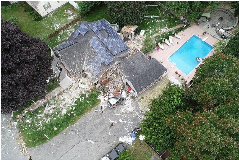
Figure 2. Aerial view of damaged home where a fatality occurred after the chimney collapsed on vehicle in the driveway.

Fire departments from the three municipalities were dispatched to address the multiple fires and explosions. (See figures 2 and 3.) First responders initiated the state's fire mobilization plan, that included mutual aid from other districts in Massachusetts, New Hampshire, and Maine.