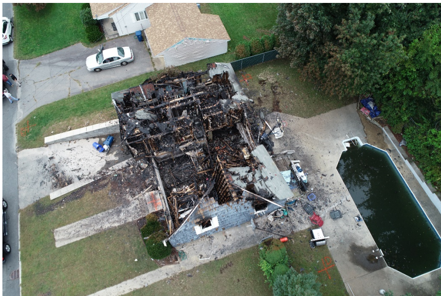
Figure 3. Aerial view of burned-out home impacted by the event.

Emergency responders asked residents to evacuate from the impacted area to four evacuation centers. At the request of emergency management officials, National Grid shut down electrical power in the affected area to remove a source of ignition. Nearby roads were closed, and freight and