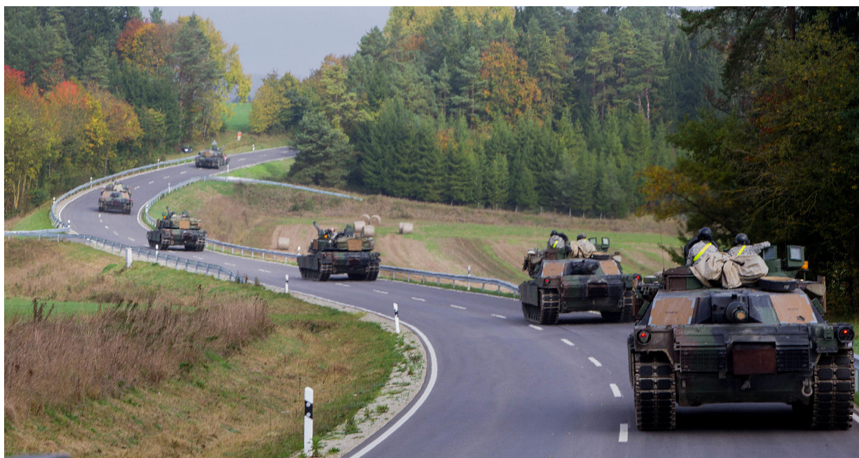
U.S. Army M1A2 Abrams tanks in Hohenfels, Germany.

The overarching problem: Russia's methods of warfare are changing, but NATO's organizing strategy and force posture are still moored to Fulda and Cold War conceptions. 17 In the