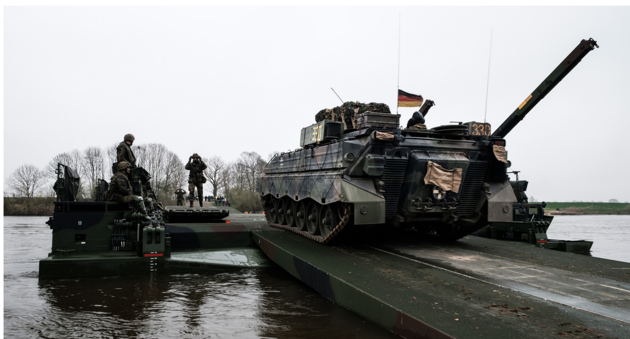
River crossing exercise prepares Germany to lead NATO's VJTF in 2019.

The Suwałki Corridor is particularly vulnerable given the continued, intensified militarization of Kaliningrad and Russia's Western Military District. All the while, Moscow is able to use Belarusian territory as either a staging ground for offensive operations against NATO, or for positioning advanced A2/AD (Anti-Access Area Denial) capabilities pursuant to its military-political agreements with Minsk. Either option is a potential threat to Suwałki and the Alliance as a whole. For Russia, closing the Suwałki Corridor is likely to be a part of a broader strategic offensive in the region. In this case, the aim would not necessarily be to hold Suwałki, but rather to deny access to it to NATO and its reinforcements.