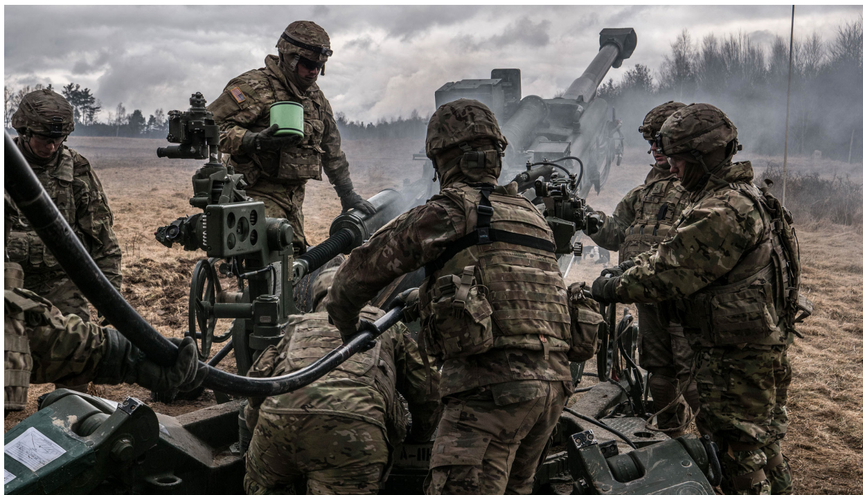
Reloading Howitzer during Exercise Dynamic Front 2018.