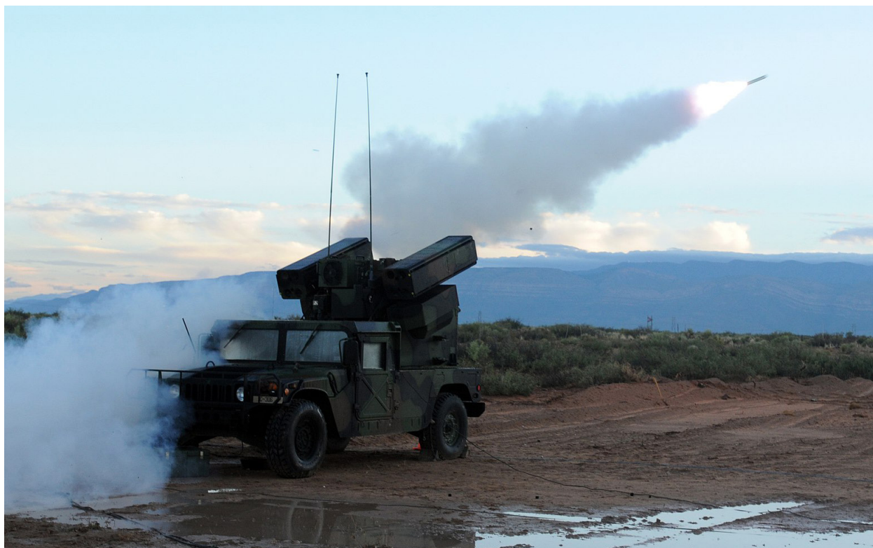
Avenger Air Defense System.

The first actionable step that can be taken immediately is to upgrade the static nature of NATO's tripwire forces with “Mobile Tripwires.” As the organizing problem with tripwires (i.e., forward deployments under Operation Atlantic Resolve North-East) is that Russia can avoid them, NATO should deny opposing planners this luxury. To this end, U.S. Army Europe Avengers could offer one meaningful solution. These offer a highly mobile short-range air defense capability. By ensuring that one battery of this battalion (at a minimum) is always permanently forward deployed in the Baltic States, U.S. Army Europe can not only provide a short-range air defense capability in the Baltics—a high value to allies—but the inherent mobility of this capability means that it can be constantly repositioned—anywhere that Indicators and Warnings (IW) of a threat might emerge. And because this mobile