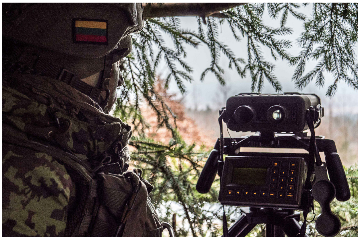
Target observer during Exercise Dynamic Front 2018.

7. Terrorist Attacks: Moscow may use the pretext of pre-empting or responding to terrorist threats, or actual attacks, as well as acts of sabotage against Russia’s infrastructure, to stage a cross-border incursion. Its armed interventions on Georgia’s territory on the pretext of eliminating Chechen jihadists during and after the Second Russo-Chechen War (1999-2002) serve as a precedent. In this scenario, a real or manufactured terrorist attack on Russian or Belarusian territory triggers an armed incursion couched as a “hot pursuit”