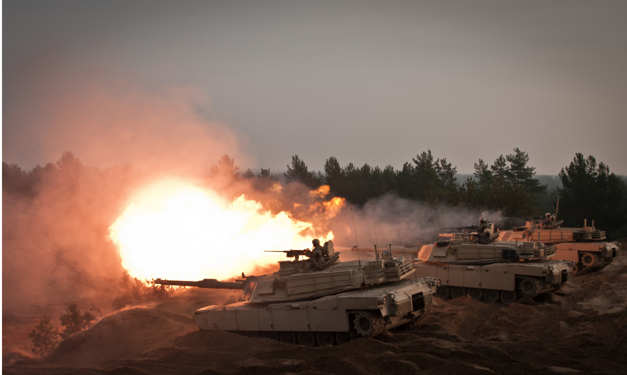
M1A2 Abrams during training in Lithuania.