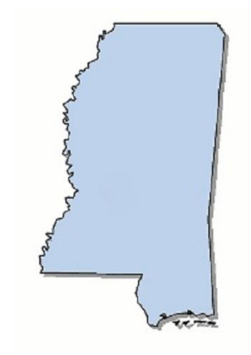
APRIL 2018 - PART 1