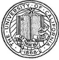
THE UNIVERSITY OF CALIFORNIA