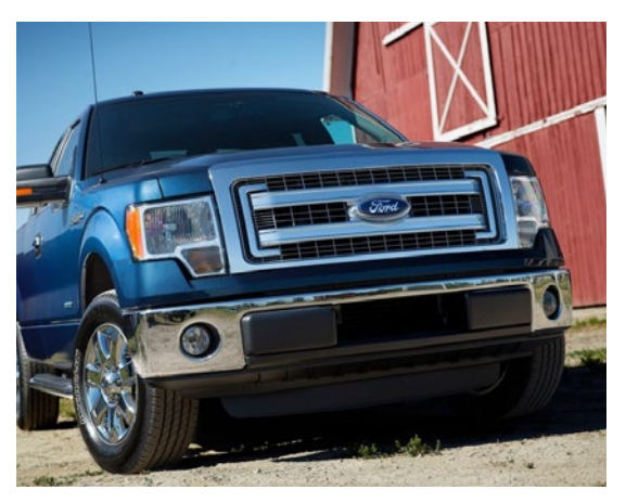
Ford's Kansas City Assembly Plant in Claycomo, Missouri has increased production of the F-150 light duty truck, created jobs, and attracted suppliers to the area.