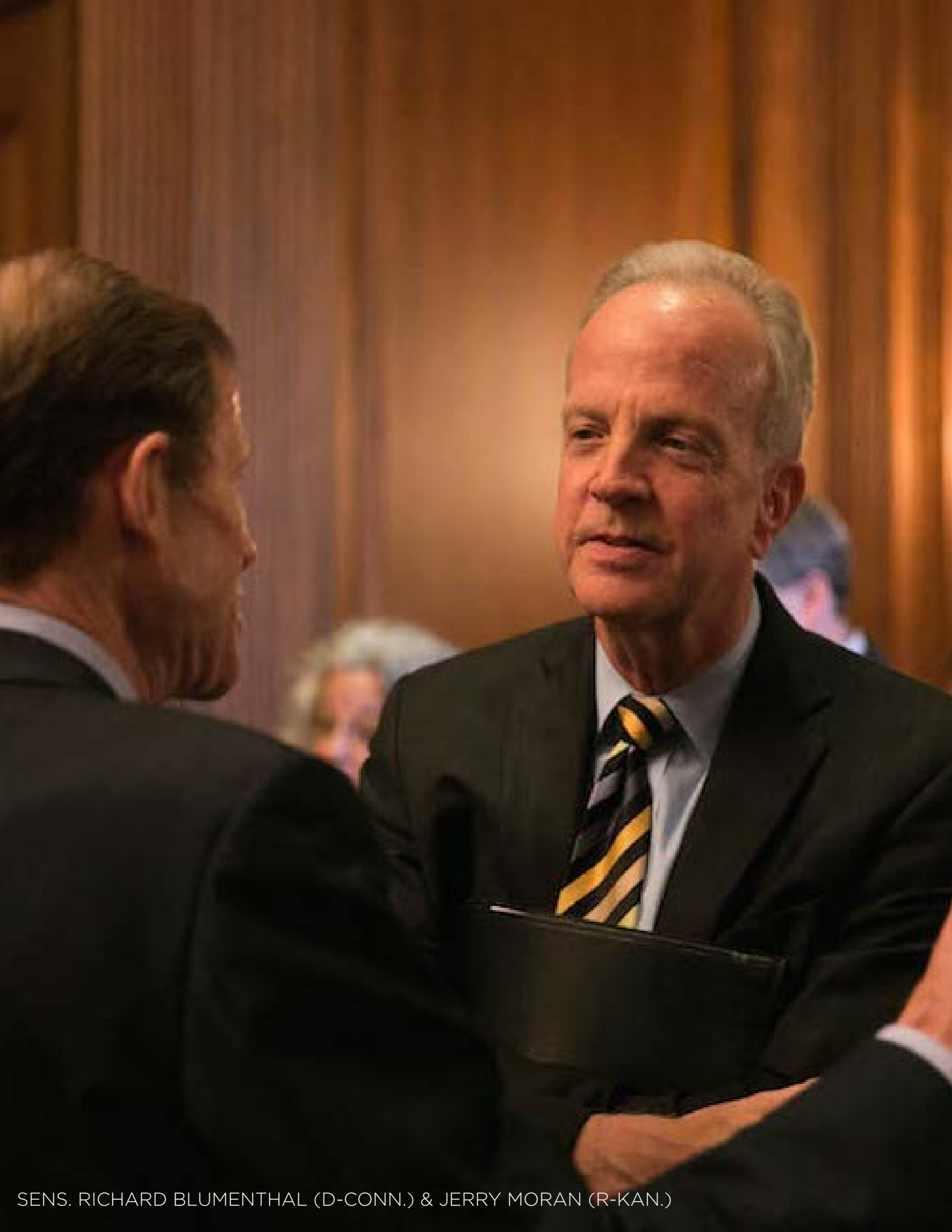
SENS. RICHARD BLUMENTHAL (D-CONN.) & JERRY MORAN (R-KAN.)