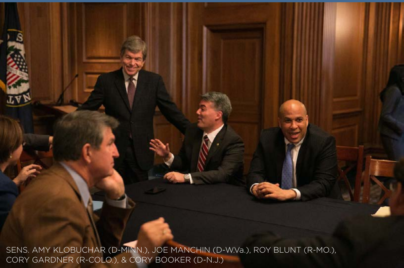
SENS. AMY KLOBUCHAR (D-MINN.), JOE MANCHIN (D-W.Va.), ROY BLUNT (R-MO.), CORY GARDNER (R-COLO.), & CORY BOOKER (D-N.J.)