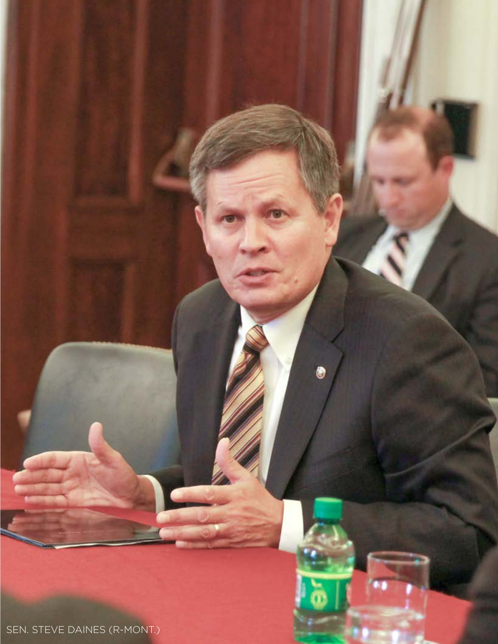
SEN. STEVE DAINES (R-MONT.)