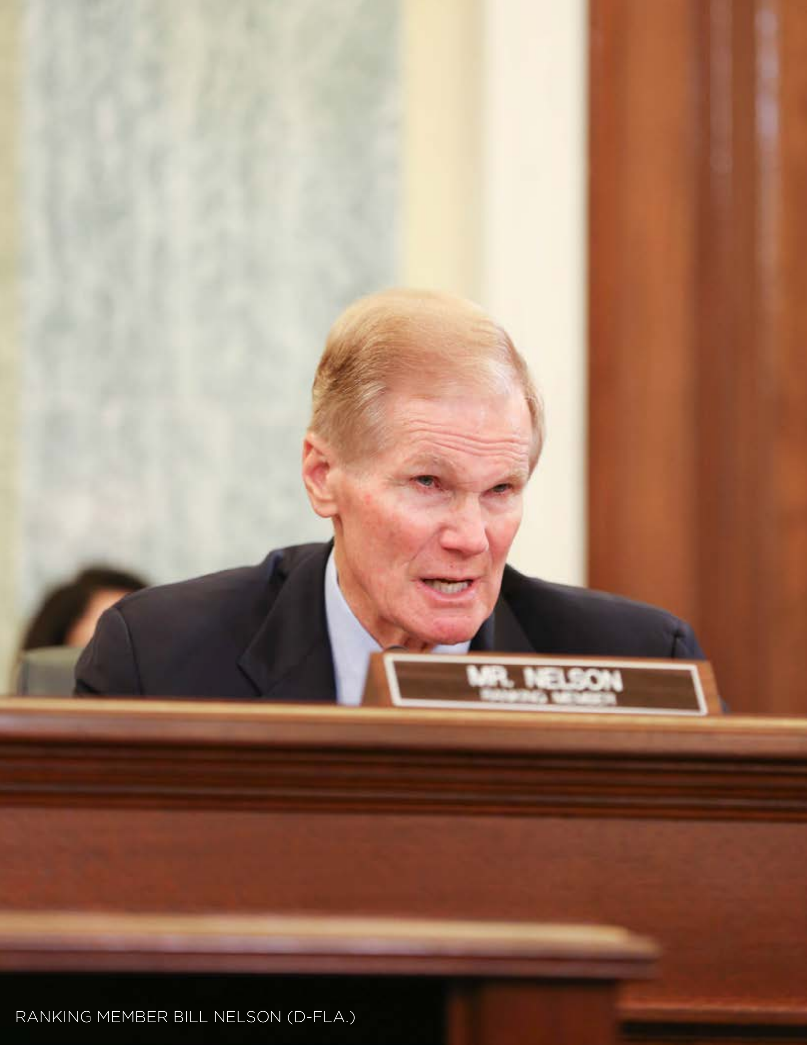
RANKING MEMBER BILL NELSON (D-FLA.)