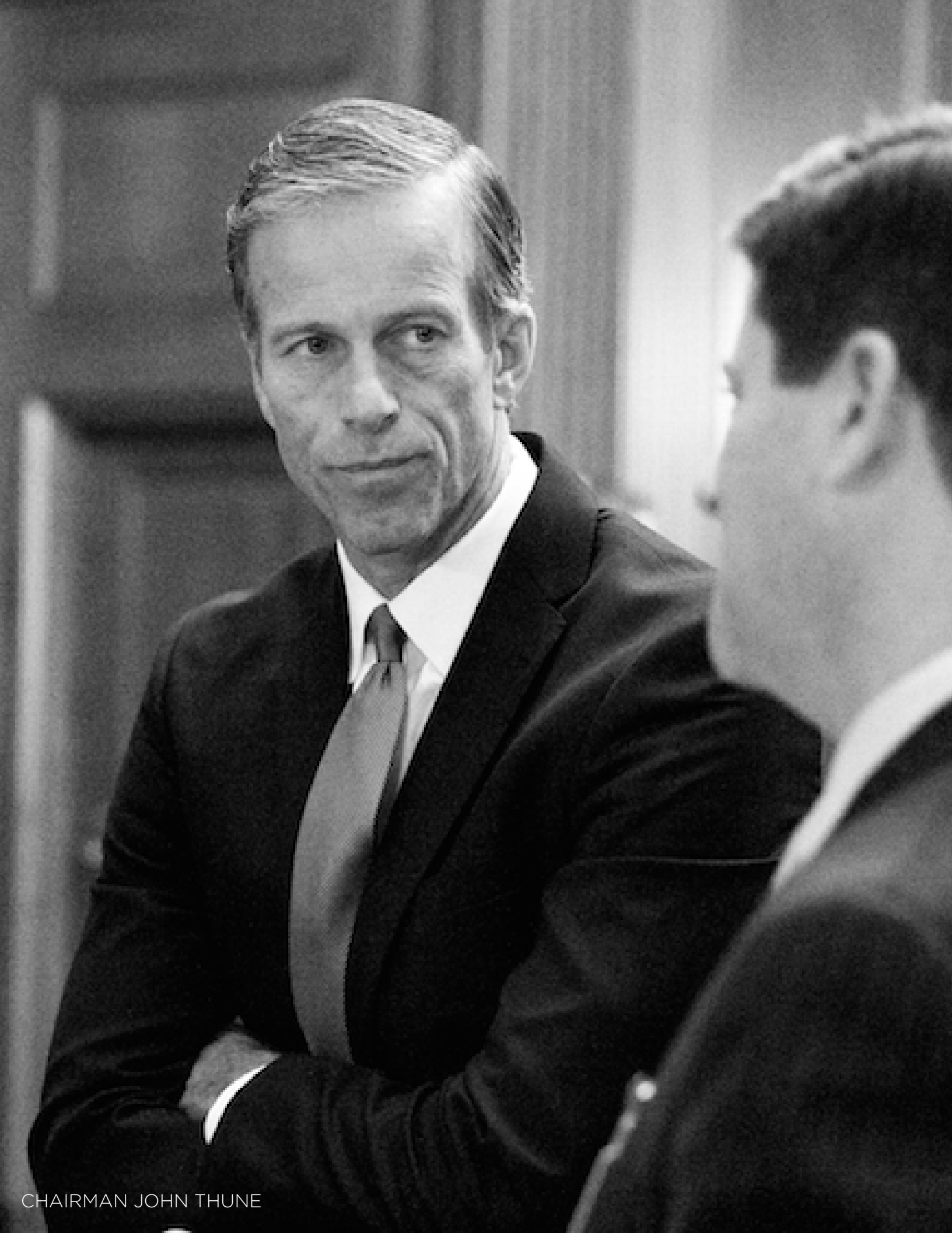
CHAIRMAN JOHN THUNE